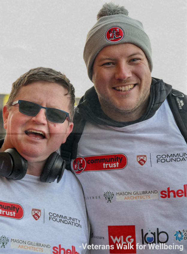
-Veterans Walk for Wellbeing