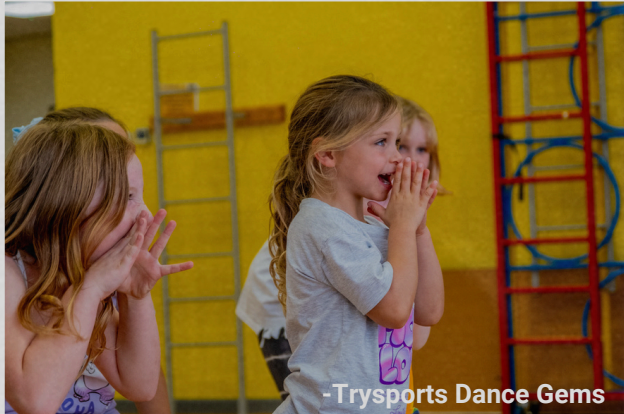
-Trysports Dance Gems