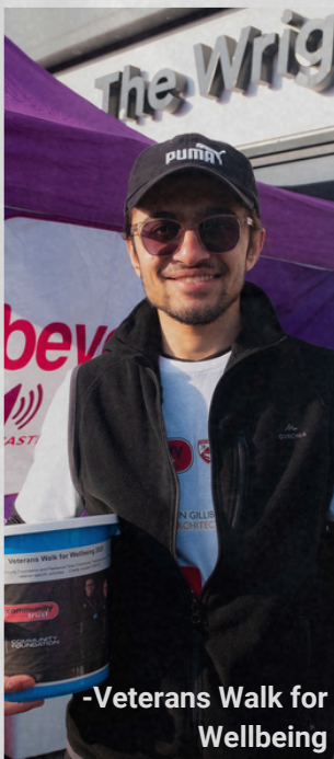
-Veterans Walk for Wellbeing