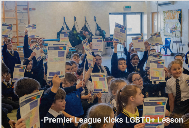
-Premier League Kicks LGBTQ+ Lesson