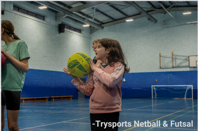
-Trysports Netball & Futsal